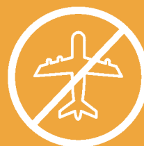
Restricting Non- Essential Travel