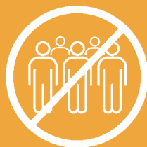
Limiting Group Gatherings