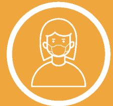
Wearing a Face Covering

The Moderna, Pfizer, and Janssen vaccines have mild and temporary side effects, including pain at the injection site, headache, fever, fatigue, chills, and muscle and joint pain. Individuals with severe allergic reactions to other vaccines should consult their doctor in case they may be allergic to a component of the vaccine. They should be observed for 30 minutes following injection rather than the usual 15 minutes. Individuals who carry an EpiPen for their allergies should bring it to their appointment. CDC notes that women who are pregnant or breastfeeding can be presented the option to vaccinate, but first talk to your health care practitioner if you have any concerns about whether you should receive it.