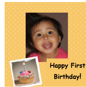
First B'Day card Project

If your dental clinic or health program clinics have a need for any of the DSC produced resources, send in your email request to Lalani at lalani.ratnayake@crihb.net